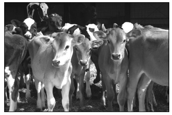
Morvan Allen's calves at NODPA Field Days

Kathy also discussed the benefits of having a diverse pasture stand, using an older cow as a model to train your heifers to graze, plus identifying physical traits in a good