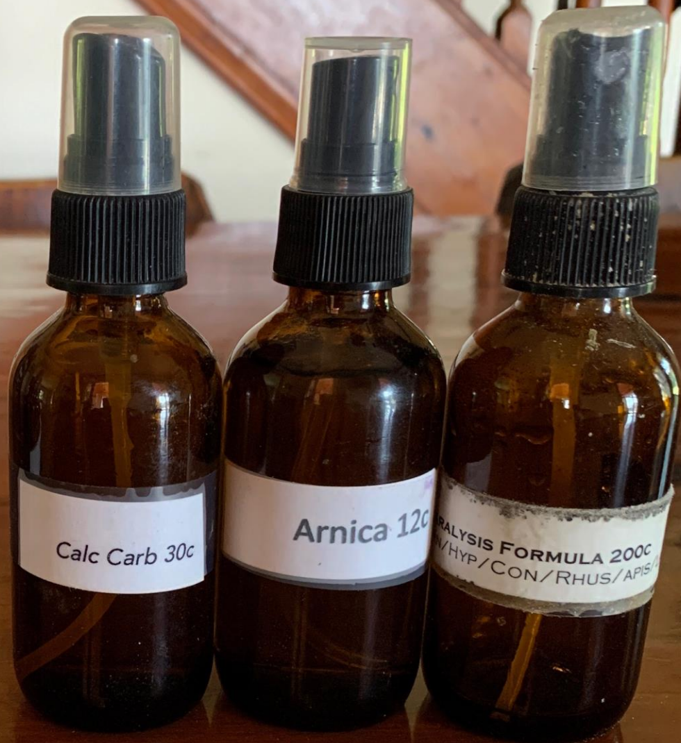
2 oz Spray bottle