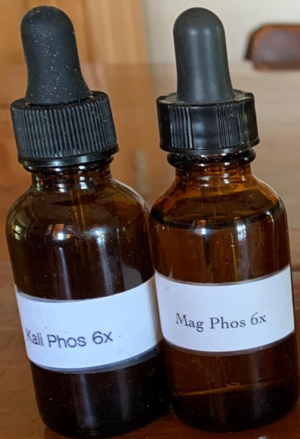
1 oz Dropper Bottle