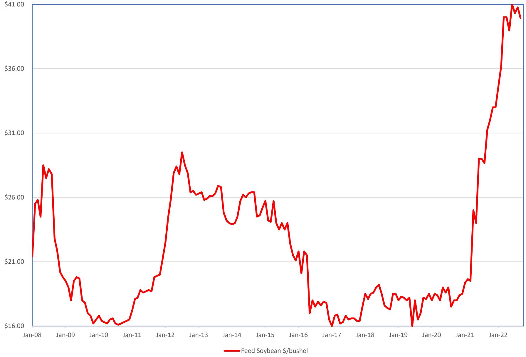
Organic Feed Soybean $/bushel 2008-2022 -USDA Market News Data - FOB Farm