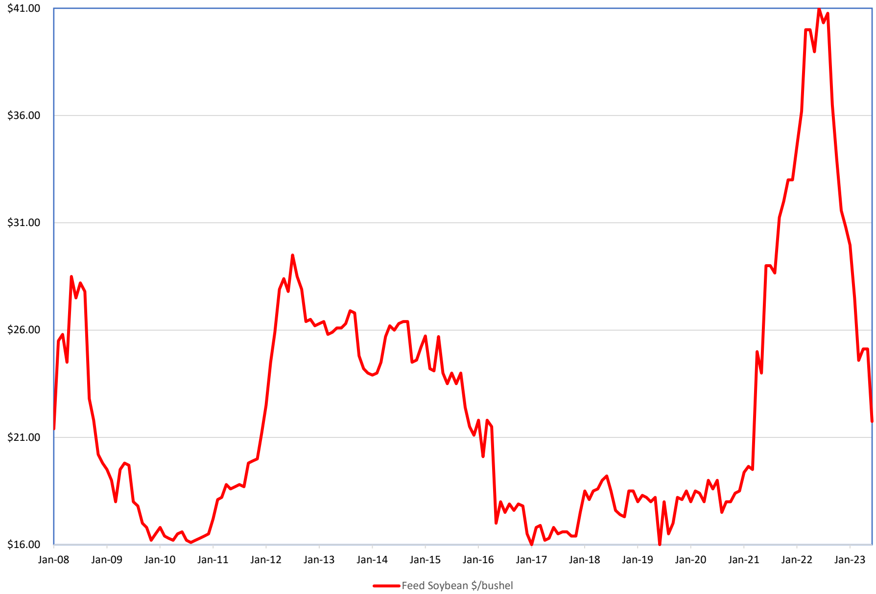
Organic Feed Soybean $/bushel 2008-2023 -USDA Market News Data - FOB Farm